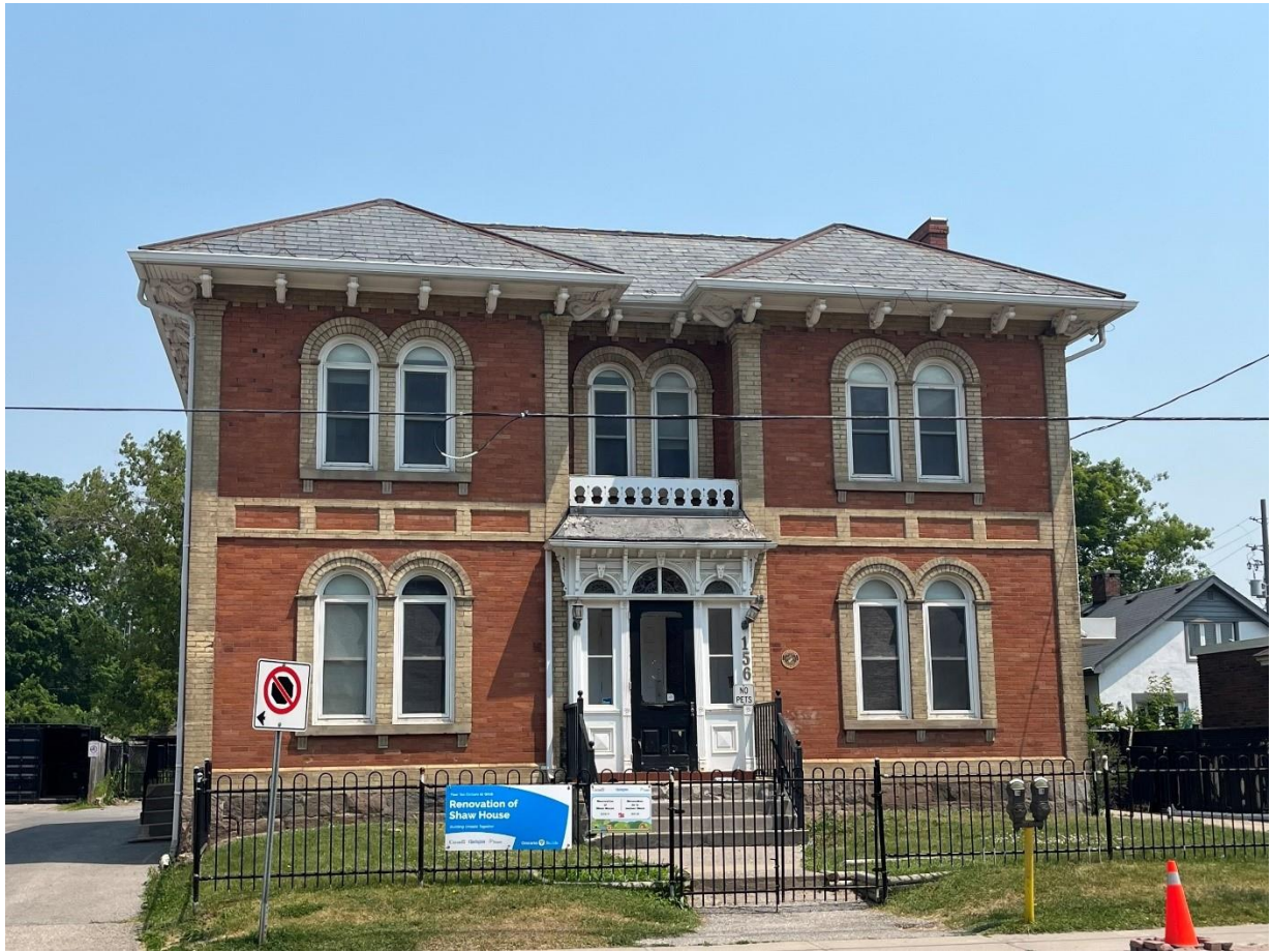
Figure 3, Front exterior image of the Shaw House, located at 156 Church St. Bowmanville