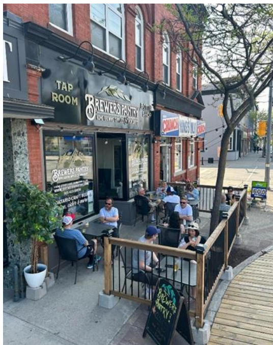
Figure 2, Customers of Brewers Pantry enjoying its new temporary sidewalk patio. Located in historic Downtown Bowmanville.

Patio construction has been completed and according to the owner, the patio has had an immediate positive impact on his business, adding additional seating and hiring staff.